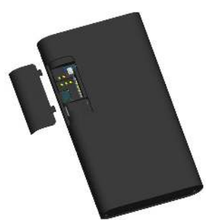
Open device cover

Open the back door case, check if device is OK and accessories are intact