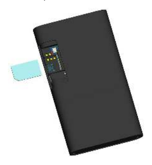
Insert SIM Card